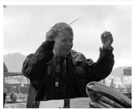
Playing in the rain at the show

Show, said "For several decades now Downton Band has brought its unique blend of vibrant brass music to the Show Grounds. We are very thankful to the Band for