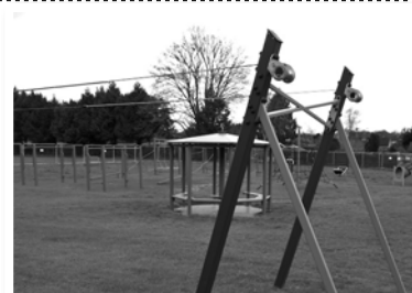
Some of the new equipment that has been installed