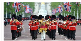
Coldstream Guards Band

Innes (Mezzo Soprano) and The Salisbury Plain Military Wives Choir. Tickets from the Cathedral's website or box office (01722 656555) and are priced between £15 and £45. Children under 18 go free.