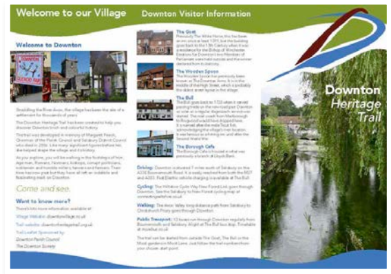
The new leaflet

There is a choice of starting points for the trail, one of which is The Goat - previously The White Horse. The building goes back to the 13th century, when it was a residence of the Bishop of Winchester. It has been an inn since at least 1599. In days gone by, elections for