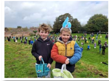
Last year's hunt

The annual egg hunt takes place at The Moot on Easter Monday, 1 April. Gates open at 10:30am for an 11am start, when there will be over 4,000 eggs to find. The cost is £3 per child (under 11s only) and each child will need to have at least one supporting adult, who will be admitted free of charge. Refreshments will be available. Dogs are not allowed at this event.