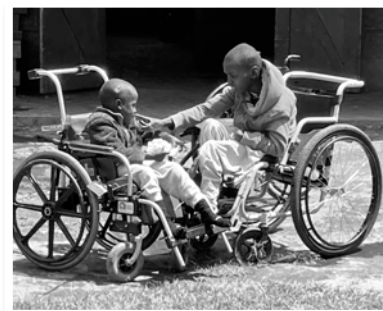
Matumaini Rehabilitation Centre

to combine knowledge and optimise care. They will offer refresher training to those from isolated communities who lack support and mentoring.