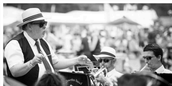
2023 New Forest Show: credit Abi Chadwick Photography

their kind gesture towards the 2024 Show, and we look forward to welcoming them playing to packed crowds at the Village Green for many years to come."