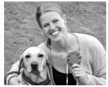
One of last year's winners

The annual Dog Show will take place on Sunday 17 September, from 2:30 - 5pm at The Moot. There will be 6 show classes (including ‘prettiest bitch’ and ‘most handsome dog’) and it will cost £1 to enter a dog in each class, which can be done on the day from 2:30pm. The winners of each class will be entered into the “Best in Show”. An agility course will run all afternoon, and there will also be a dog handling demonstration. Refreshments will be available. Entrance will cost £2 for adults and £1 for children - the organisers are requesting that all children should be accompanied by an adult. Proceeds from the day will go to The Moot.