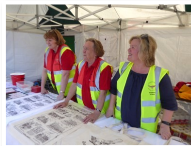
Information Tent Team 2022