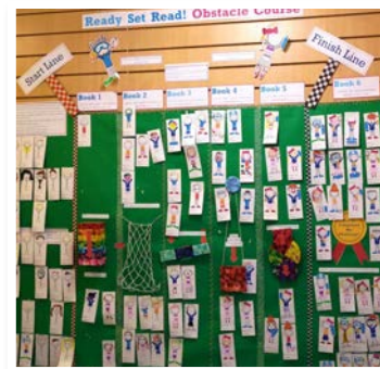
Reading Challenge Obstacle Course