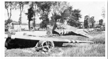
Glider landing site

The event is in aid of three charities relating to the D-Day Landings. Tickets are £5 or by donation and available from Malcom Dean on 07776 132775. A licensed bar will be available.