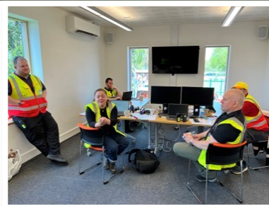
Event Control Team 2022

For more information, the Cuckoo Fair Committee can be contacted at produce@cuckoofair.co.uk