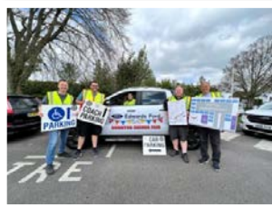
Signage Team 2022

The Fair is seeking new members who can take up specific roles such as Assistant Booking Manager, Memorial Gardens Manager, High Risk Documents Reviewer, Website Manager and more. The fair also needs volunteers who can help the Build Team just prior to the Fair or help with putting up gazebos during the summer, which is an important source of income for the Fair.