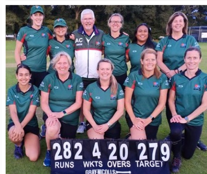
Ladies Softball Team